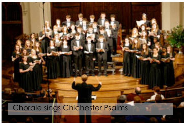
Chorale sings Chichester Psalms