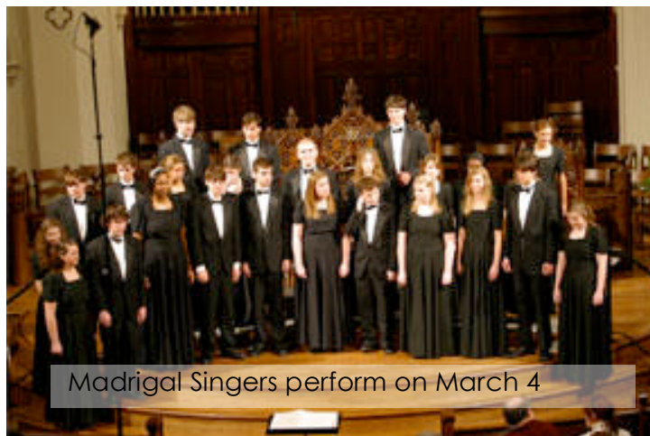
Madrigal Singers perform on March 4