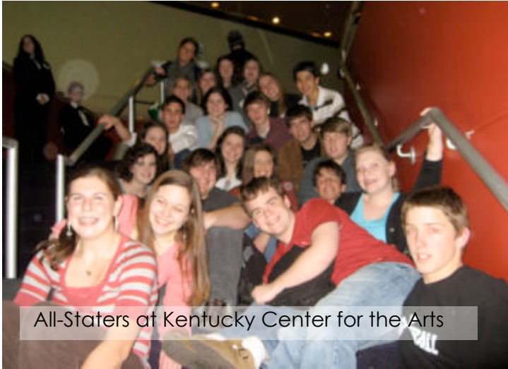
All-Staters at Kentucky Center for the Arts