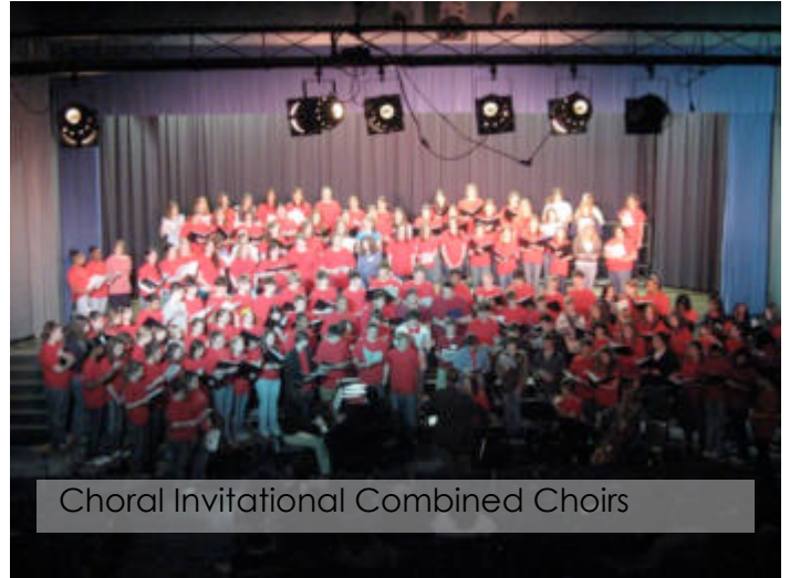
Choral Invitational Combined Choirs