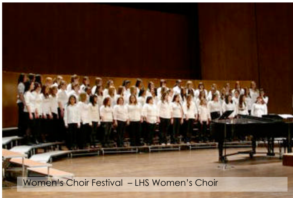
Women's Choir Festival – LHS Women's Choir