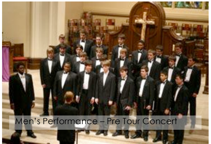
Men's Performance – Pre Tour Concert