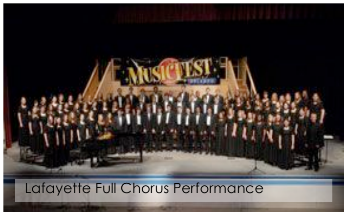
Lafayette Full Chorus Performance