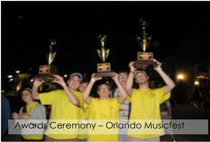
Awards Ceremony – Orlando Musicfest