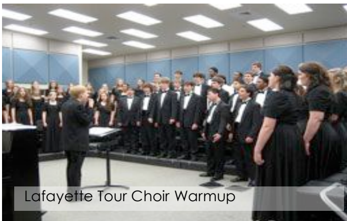
Lafayette Tour Choir Warmup