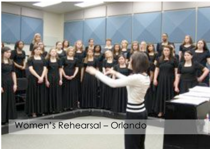
Women's Rehearsal – Orlando